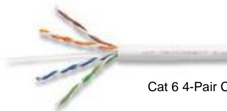
Cat 6 4-Pair Cable