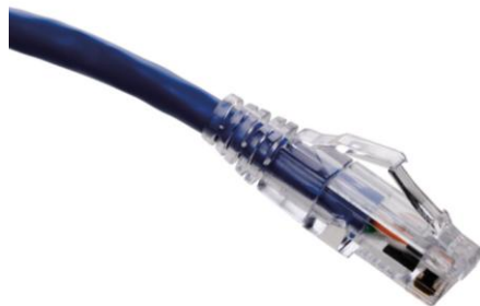
Slim Line Assemblies